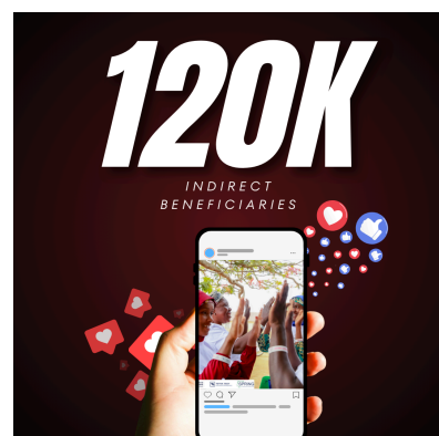
Fig. 1: Number of indirect beneficiaries (Social media)

Infographics were also utilized below to present key data and outcomes in an accessible and visually engaging format.